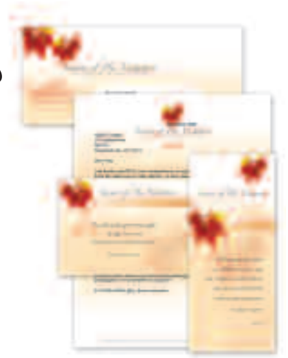
Watch your mailbox for this special mailing!

E ach fall, CBN gathers for a week of prayer and intercession for our partners. We want to pray for you and your loved ones during our annual Seven Days Ablaze Week of Prayer – September 29 - October 3. Please watch your mail for this special invitation – and use the reply card to send us your personal prayer request. You will also receive a booklet of Scripture verses to bless and encourage you. God is faithful to answer prayer, and we look forward to a powerful visitation from the Lord. ♦