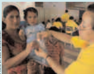
The largest pill distribution in a CBN medical mission was in 2007 when 2 million anti-parasite pills were given out in Peru.

Malnutrition is just one of the many chronic health problems plaguing Latin Americans, all because of intestinal parasites. Parasites consume 25 percent of a person’s food intake, causing constant pain, bleeding and stunted growth.