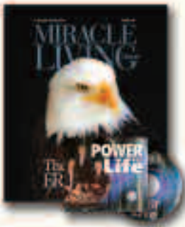
Examples of monthly gift