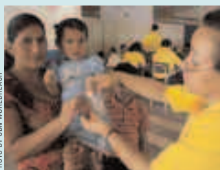
The largest pill distribution in a CBN medical mission was in 2007 when 2 million anti-parasite pills were given out in Peru.

Malnutrition is just one of the many chronic health problems plaguing Latin Americans, all because of intestinal parasites. Parasites consume 25 percent of a person’s food intake, causing constant pain, bleeding and stunted growth.